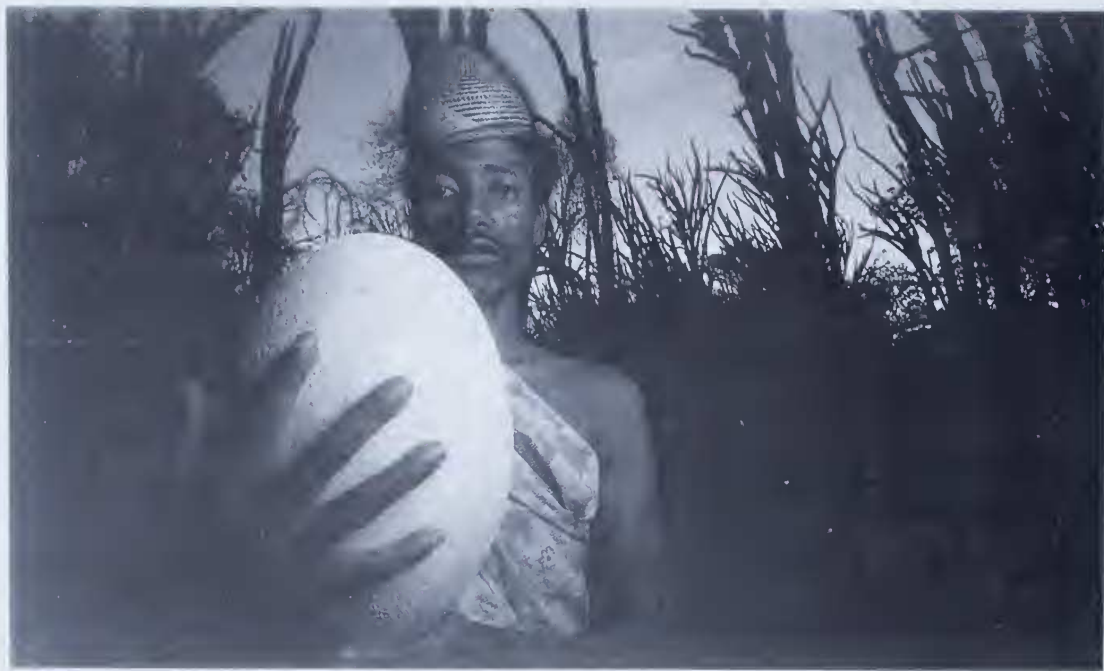
Figure 3 A Malagassy Aepyornis egg in its native land, Madagascar.

Aepyornis , yet the study of the second egg, from Cervantes, confirms its identity as also Aepyornis .